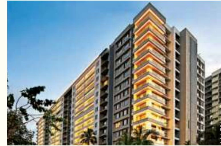
RUSTOMJEE ELEMENTS | OFF JUHU CIRCLE Located Off Juhu Circle, Rustomjee Elements is one of the most luxurious Gated Communities in the city of Mumbai.

12,300 HOMEOWNERS | COMPLETED OVER 14.2 MILLION SQ FT OF CONSTRUCTION 215 COMPLETED BUILDINGS | 30,000+ RUSTOMJEE FAMILY MEMBERS | 35 PROJECTS 2 TOWNSHIPS SPREAD ACROSS HUNDREDS OF ACRES | GATED COMMUNITIES