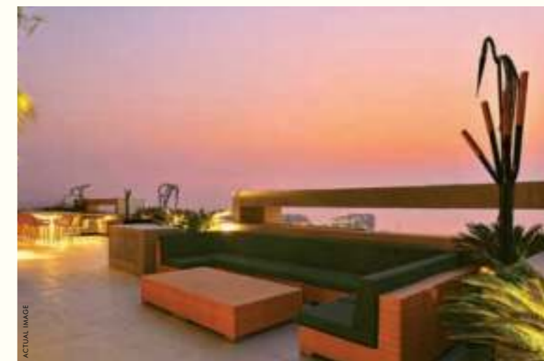
RUSTOMJEE PARAMOUNT | KHAR (W) A signature Gated Community with breathtaking vistas of the Arabian Sea.