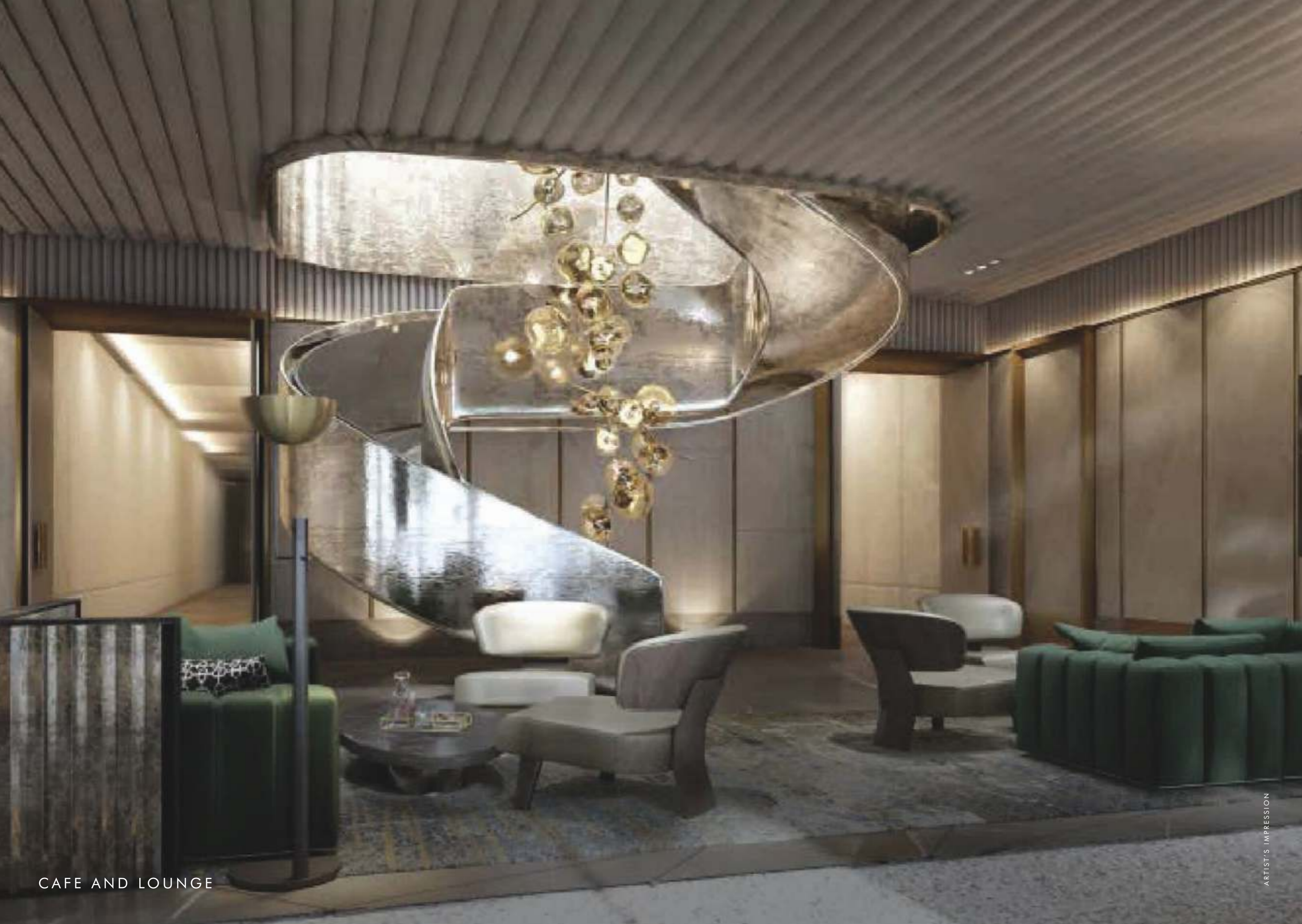
CAFE AND LOUNGE