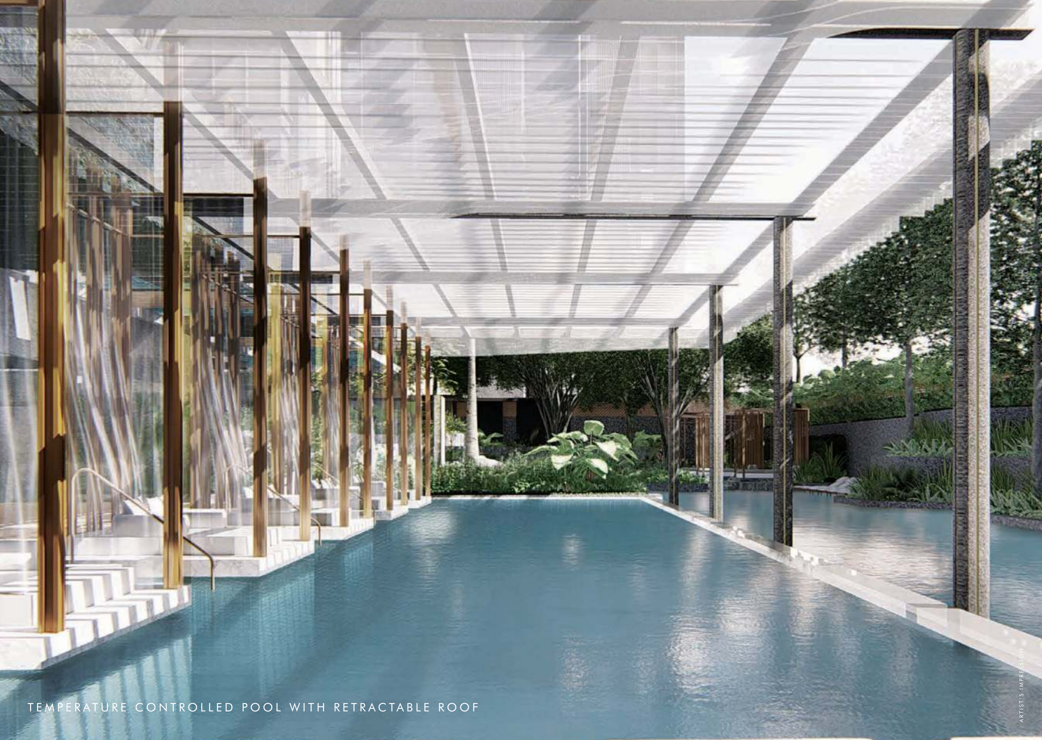
TEMPERATURE CONTROLLED POOL WITH RETRACTABLE ROOF