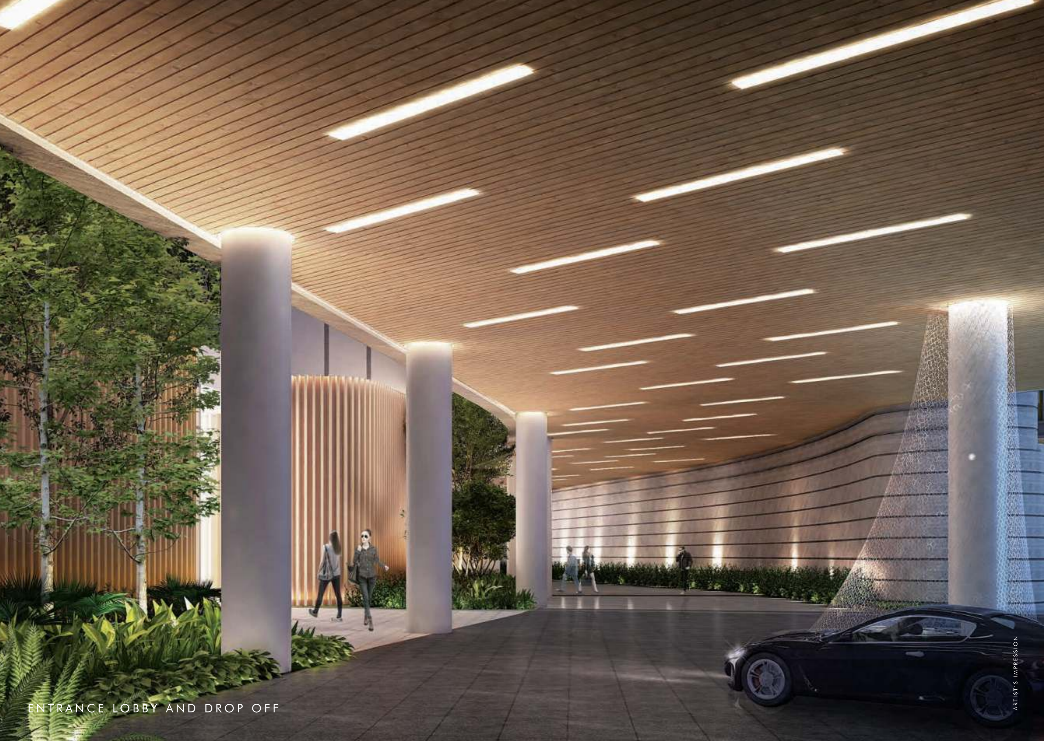
ENTRANCE LOBBY AND DROP OFF