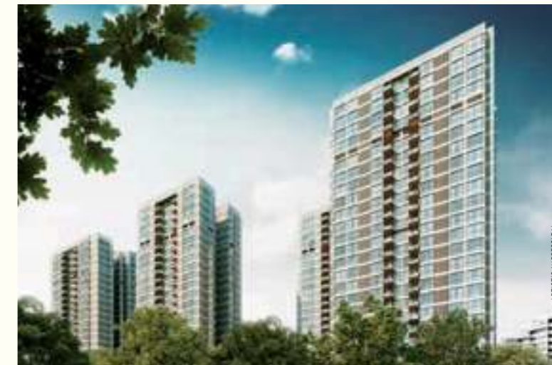
RUSTOMJEE SEASONS | BKC ANNEXE Spread over 3.8 acres, BKC's foremost Gated Community offers bespoke living experiences.