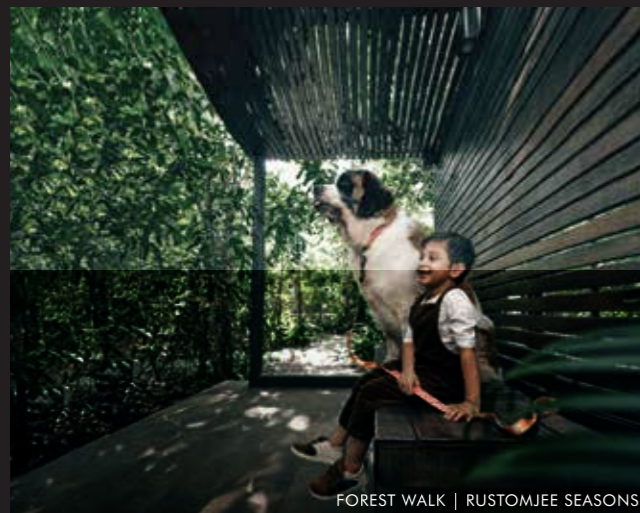
FOREST WALK | RUSTOMJEE SEASONS