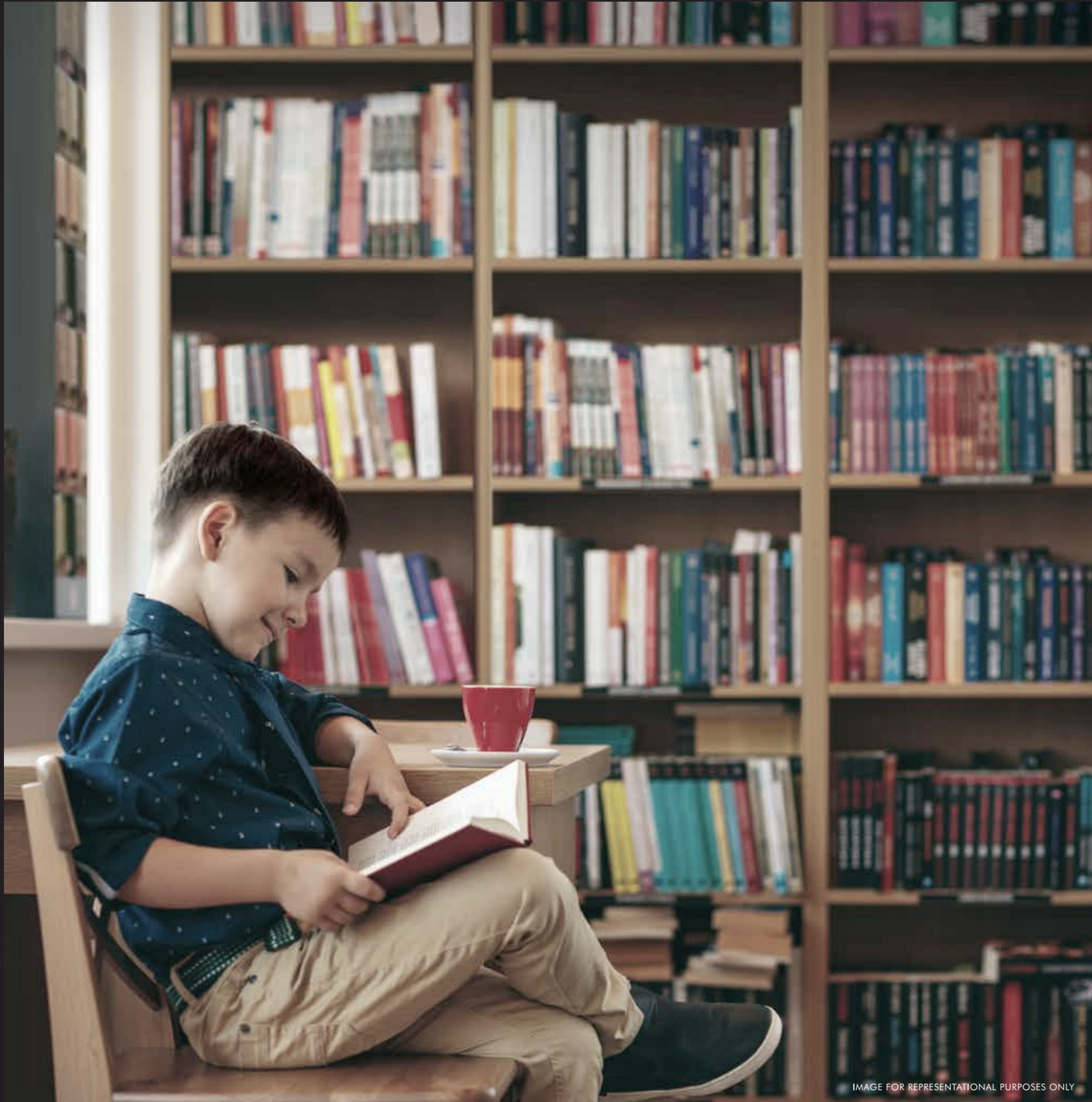
IMAGE FOR REPRESENTATIONAL PURPOSES ONLY