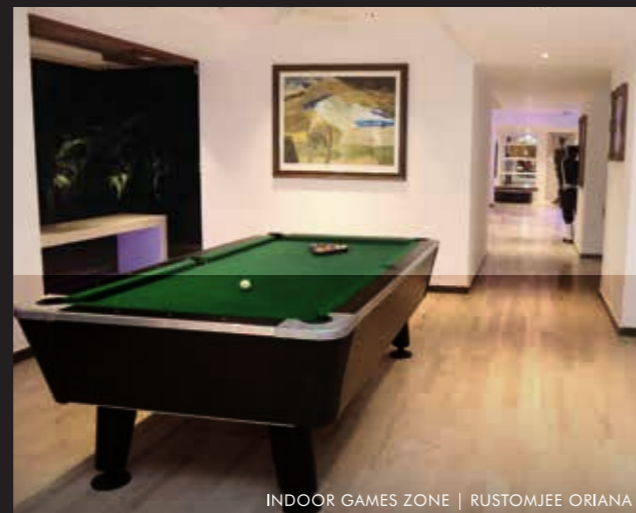
INDOOR GAMES ZONE | RUSTOMJEE ORIANA