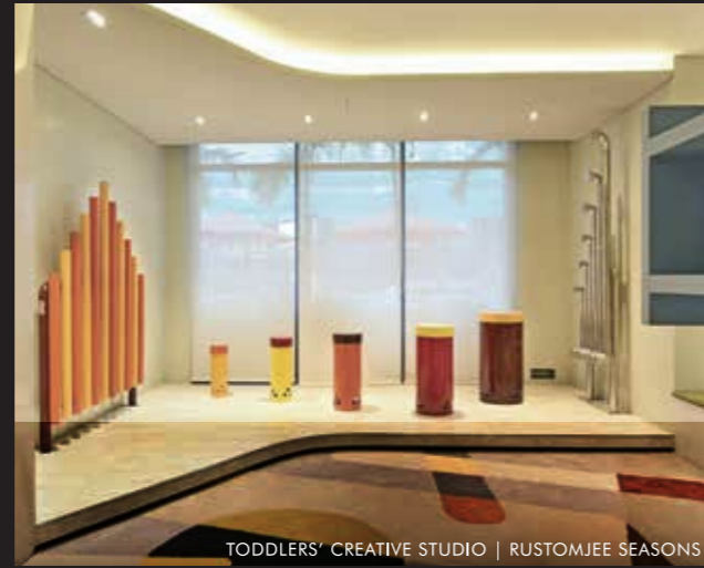
TODDLERS' CREATIVE STUDIO | RUSTOMJEE SEASONS