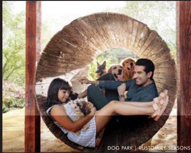
DOG PARK | RUSTOMJEE SEASONS