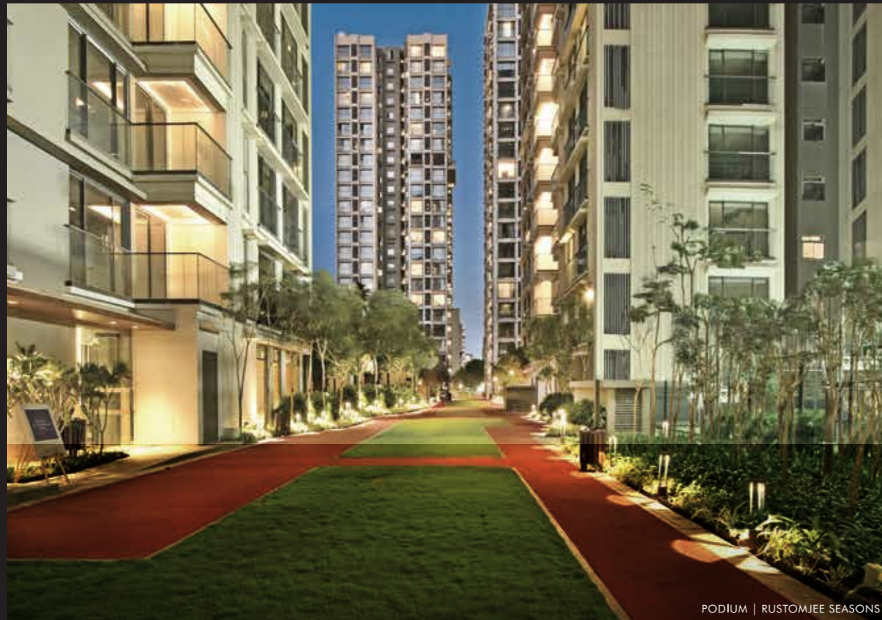
PODIUM | RUSTOMJEE SEASONS