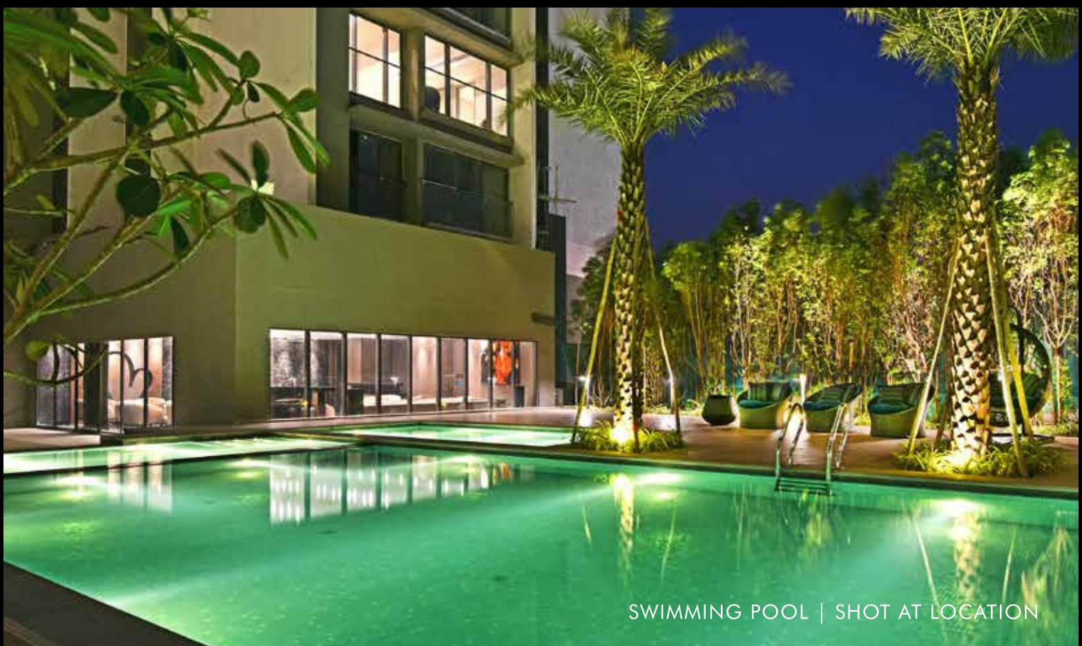
SWIMMING POOL | SHOT AT LOCATION

----- Only a few 4 bedroom Privé Residences remain